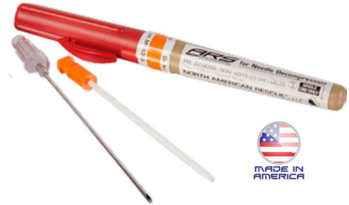
Fig. 1) 10 or 14 ga Needle Decompression kits from NAR are made with American surgical stainless steel grade 304.

Many agencies, including the FDA, are aware of inferior grade stainless steels, which have resulted in the implementation of import alerts (i.e. FDA Import Alert, # 76-01). Import alerts are intended by the FDA to prevent the importation of inferior grade materials which may have safety or efficacy concerns. Buying American materials such as the ARS® ensures properly sterilized materials and reduces health risks to our soldiers.