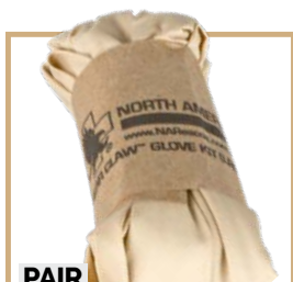
PAIR 1 Nitrile Gloves, Lg